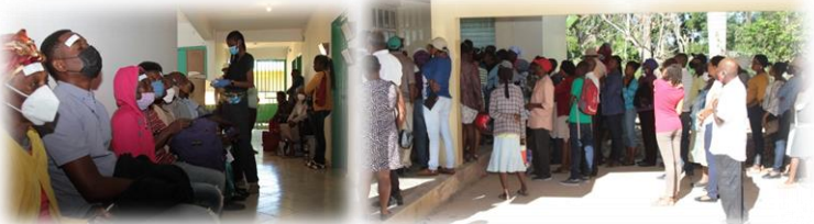
It's always busy and lots of traffic at the Eye Clinic