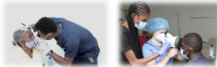
We provide eyecare training for our volunteers & locals