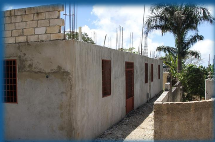
Picture of the first floor of the outpatient clinic

The final touch is underway for electricity and plumbing for the outpatient clinic.