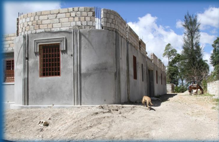
St-Joseph Hospital Outpatient Clinic – Under Construction