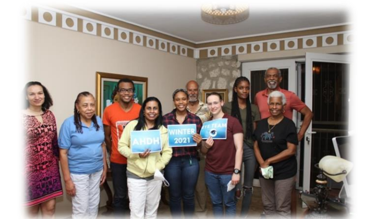
Eye Team Picture